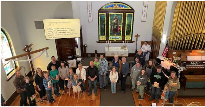
On April 14, ten students received Spark Bibles and 3 students received Spark Story Bibles at Esther! "Your word is a lamp to my feet and a light to my path." Psalm 119:105